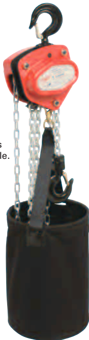
Chain Bags also available.